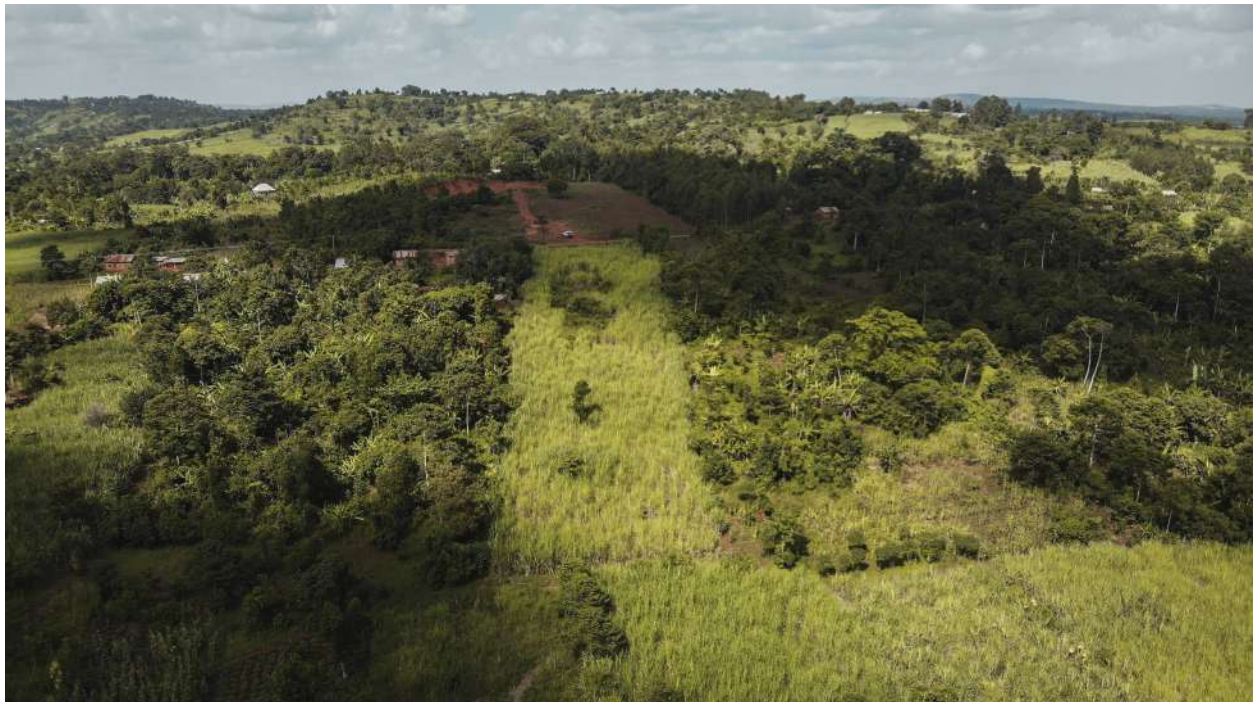
Land Purchased for Malaria Center II 1

Due to the COVID 19 pandemic construction on Malaria Center II was no able to begin in late 2020 as planned. With reduced restrictions from the Government revolving around COVI 19, construction planning is moving forward. The new Center will be located within the Jinja District. Malaria Center II will be located near the Nile River within a more densely populated area. This will allow Healing Faith to reach an underserved and larger population. This will not only benefit the at-risk community but will provide jobs for Ugandan National both during the construction process and the long-term operation of the Center itself.