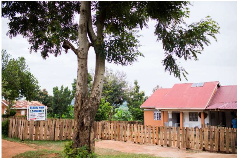
The Malaria Center first opened to patients in August 2017

The Center is staffed with 5 medical personnel; a medical clinical officer, a laboratory technician and 3 nurses. In addition, the Malaria Center is equipped with a social worker and 2 outreach team members who are trained to meet the educational physical needs of both the patient and the care giver/family members who brought the patient to the Center. Support staff is also on duty to maintain and allow for smooth day to day operations.