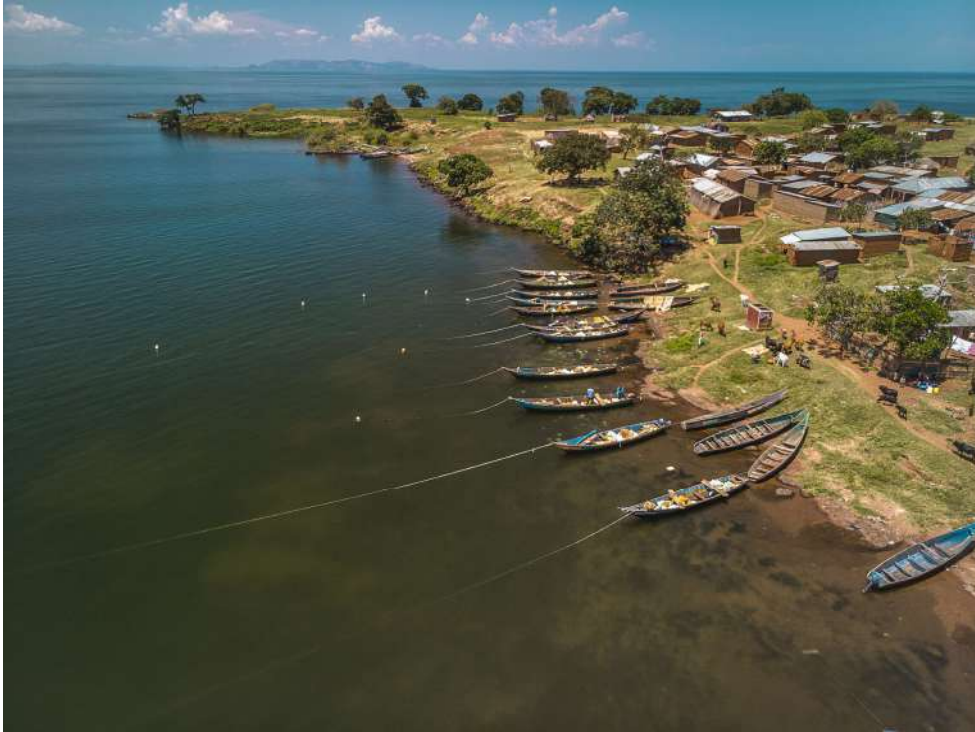
Island of Jaguzi located in the Maygwe District