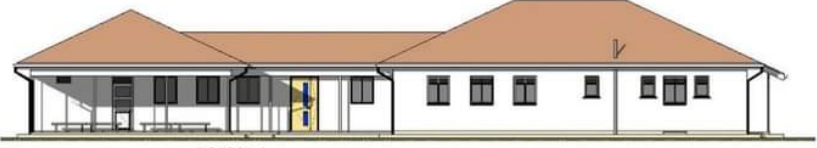
10 ELEVATION - 1 1:75