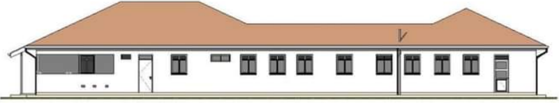
12 ELEVATION - 3 1:75