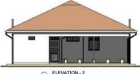
11 ELEVATION - 2 1:75