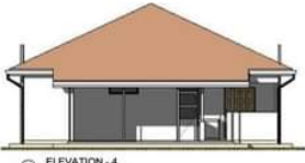
13 ELEVATION - 4 1:75